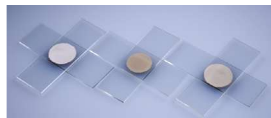
Three Color Variations in Uncured Silver Epoxies